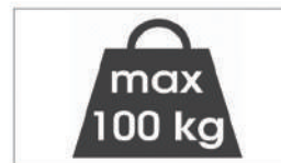
100 kg Load