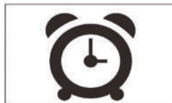
Sit/Stand Time Reminder